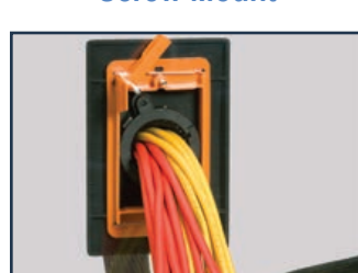
Fits in Single Gang Wall Box