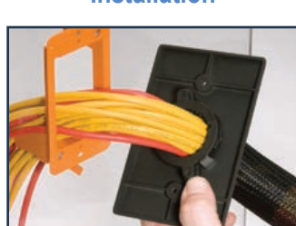
Easy Clip, No Special Tool Required