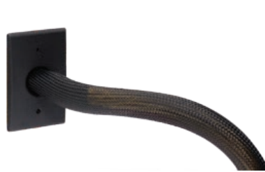
Flexo Mounting Wall Plate & Flange