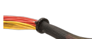
Flexo Flange - Pack of 5