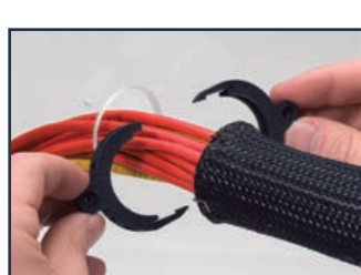
Easy Field Installation

Flexo Mounting System (FMS) has been created to attractively terminate applications with a secure mountable end.